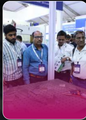
Institutional Buyer Program